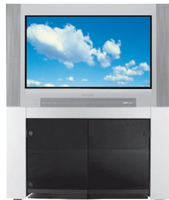
Shown above with optional matching TC309815 stand.